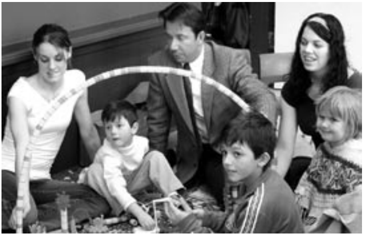
Hon. Scott Brison visited the Tiny Tot's Academy Child Care Society in Enfield in March to announce funding for the facility. Minister Brison said balanced budgets and ongoing debt reduction are a gift to future generations of Canadians. (more on page 3)

to the most extensive review of government spending in modern history. "The expenditure review process identified $11 billion in savings that will be reallocated to higher priority programs, and it will become an ongoing exercise that will be part of the very core government so that our spending consistently reflects the current reality," Minister Brison said.